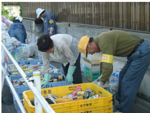
Nagoya Citizens Sorting Recyclable Wastes