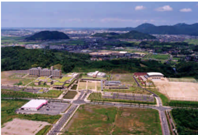
The Tottori University of Environmental Sciences

The department’s approach to education and research is one that centers on social sciences while integrating natural sciences to understand the mechanisms of the natural environment. It aims to foster human resources that can design and implement a variety of environmental policies such as statutory regulations, economic tools, environmental education, and public awareness raising, in order to establish sustainable socio-economic systems. Therefore, the curriculum mainly consists of subjects essential to dealing with environmental issues, combining social sciences such