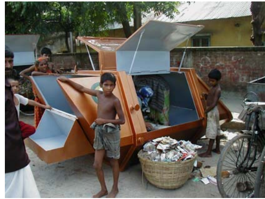
Photo: Waste collection experiment using newly introduced containers.

The recycling industry recovers 436 t/d of material in total. The amount recovered is the reduction of waste to be managed by the DCC. According to the estimate,