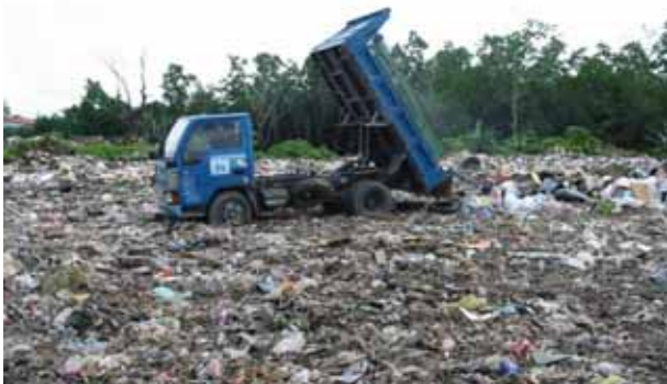
Present Condition of the Final Disposal Site

The country has nearly 20,000 of population. 70% of the population resides in the capital area, which leads to high population density in urban area. The major industries are tourism, small scale agriculture and fishery.