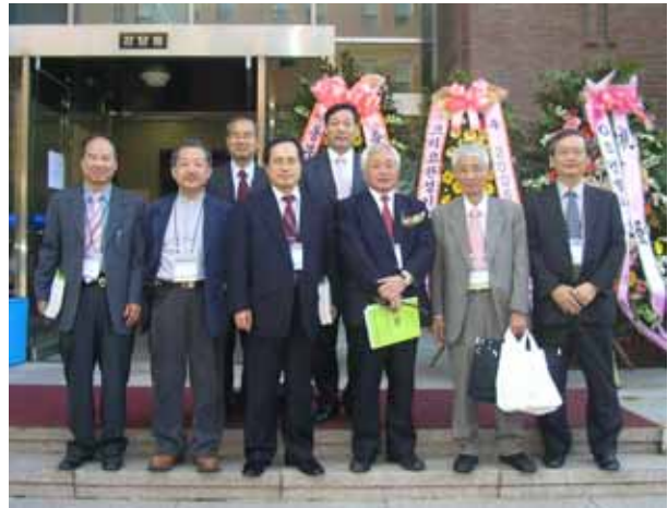
JSWME took part in KSWME Research Conference

The author also participated an international symposium