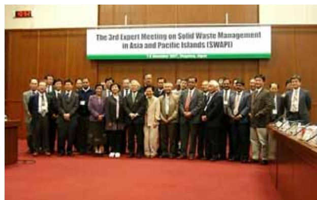
Participants of the 3 rd SWAPI, Okayama

The expert meeting featured continued discussion on the objectives, structure and activities of SWAPI (Society of Solid Waste Management Experts in Asia & Pacific Islands) that were agreed upon at the previous conference. An agreement was reached as a result of these discussions on a pragmatic operation policy to broaden the establishment of SWAPI without setting strict regulations such as collecting membership fees. At this meeting, an advisory committee composed of solid waste related organizations (chaired by the president of JSWME) was established as a domestic support structure of SWAPI (the international committee will be responsible for secretariat activities). The group chose as its future activities the sharing of examples pertaining to methods to grasp data on solid waste, information on hazardous wastes, and use of solid waste biomass. These discussions and agreements are included in the Chairperson's summary statement.