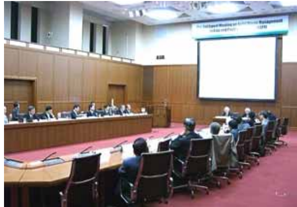
The 3 rd Expert Meeting (SWAPI)

Asia-Pacific region at the Okayama International Center on November 7 th to the 9 th . Experts from 15 countries and regions gathered at the conference and an open seminar held at that time was attended by 230 guests.