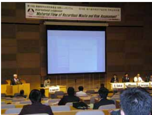
The Panellists at the 18 th JSWME Annual Conference