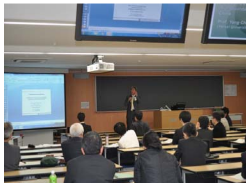
Lecture by Prof. Yong-Chil Seo

conducting the waste generation or cost analysis of their own countries. We expect this research to bear fruit in future.