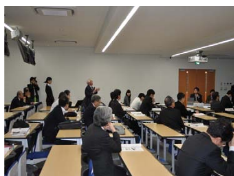
Question and answer session